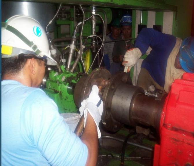
STEAG STATE POWER