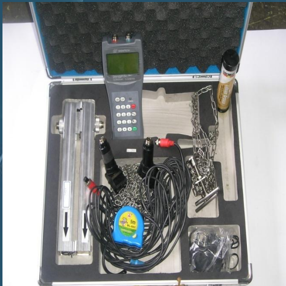
Non-Intrusive Flow Meter