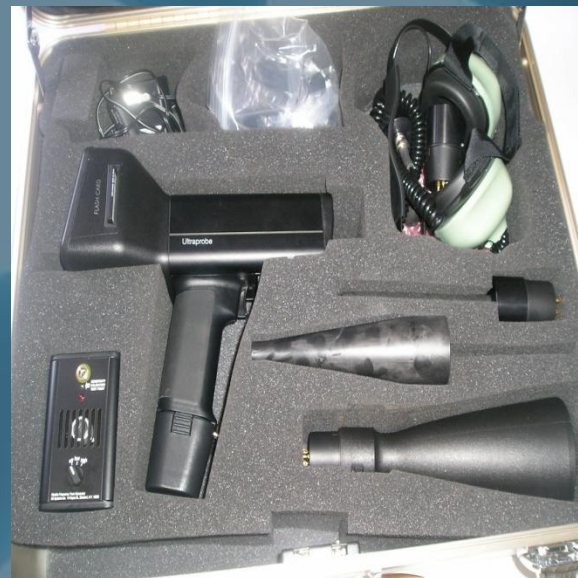
Ultrasonic Sound Meter